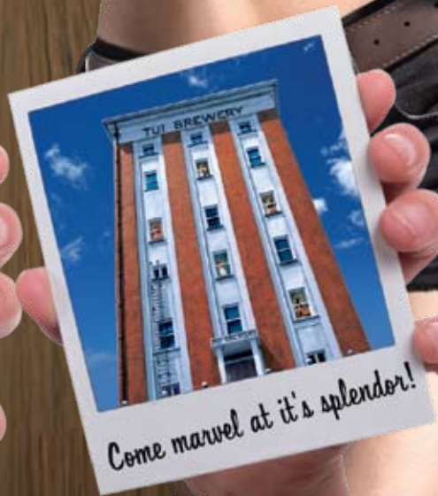
Come marvel at it's splendor!