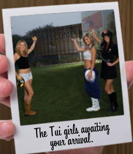
The Tui girls awaiting your arrival.