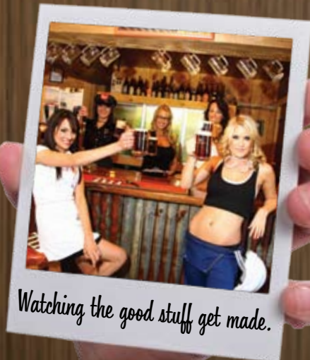
Watching the good stuff get made.